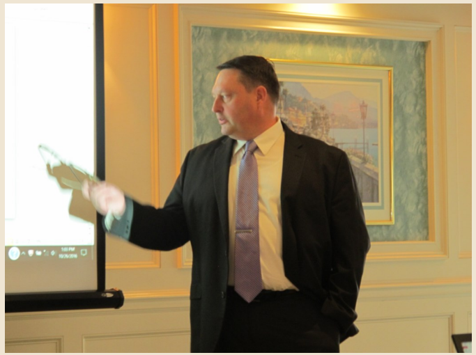
Land Residuals & Valuation