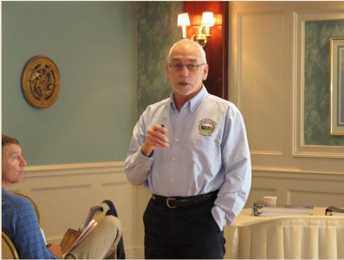
Marshall & Swift Cost Reconciliation